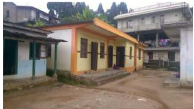
Evidence of clean school campus