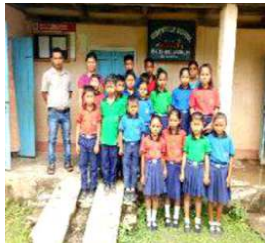
Evidence of clean school campus