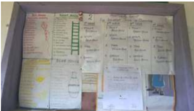
Notice board representing cleaning assignment for students.

This is one of the learning that WASH Team replicated in other schools motivating them to adopt the similar plans. The efficacy and the impact of the performance of students were clearly evident as the school campus is maintained and cleaned by the students who enjoy carrying out their tasks. This routine also helps the students adopt similar activities at home which can be a motivation for their family and neighbours.