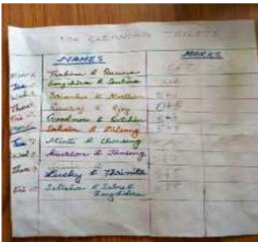
Notice board representing cleaning assignment for students.

The impact is visible. Not only the toilets are cleaned regularly, the students themselves demand the cleaning task and encourage others to engage in WASH activities.